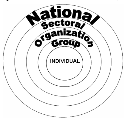
Fig. 1. Hofstede's levels of culture

The levels of culture can overlap, but as a rule they are always into each other as well, starting form individual culture, which is a part of different other cultures (Fig. 1).